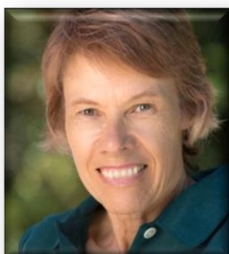
AMBER DeANN Facebook Page